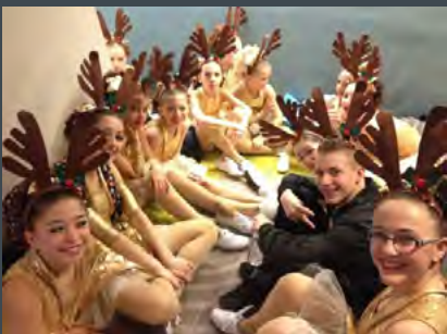
2013 dancers take a break before dancing down Main Street USA!