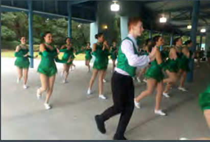
2015 dancers rehearse before their performance!