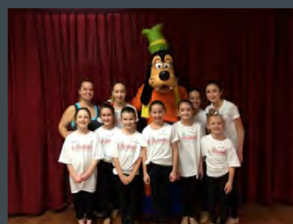
2014 Disney World dancers pose with Goofy after a special audition workshop!