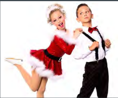
2016 dancers practice their duet moment before the Showcase!